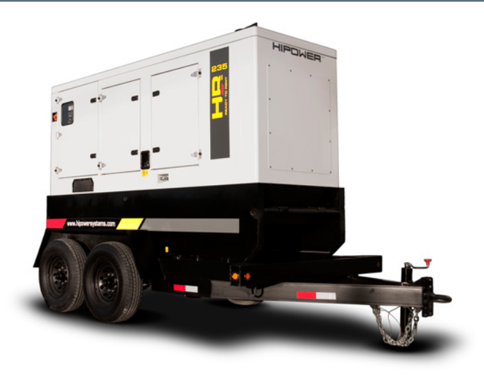
Photo depicts a typical model but may not include options such as trailer.