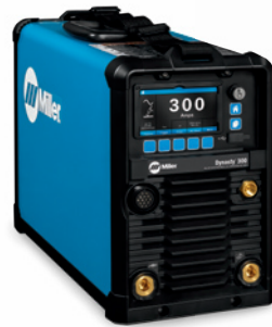
Dynasty 300 Machine only