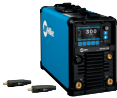
907818 Dynasty shown.

Select desired stock number for each step.