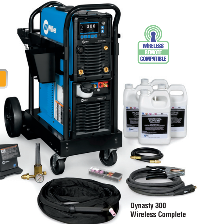
Dynasty 300 Wireless Complete