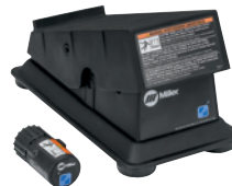
301580 remote shown.