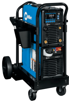
907818002 Dynasty 300 TIGRunner® shown with four bottles of 043810 Low-Conductivity Coolant.

Select desired stock number for each step.