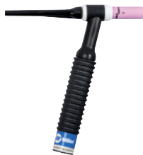
Note: A-200 (WP-26) torches require 195379 connector.

Weldcraft™ A-250 TIG Torch 301525025 No valve 301526025 With valve 250-amp air-cooled two-piece torch with 25-foot (7.6 m) cable. Note: Two-piece torches require connector: 042533 Dinse-style 191981 Tweco-style