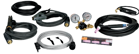
301311 kit shown.