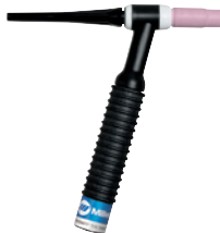
Note: A-150 (WP-17) torches require 195378 connector.

Weldcraft™ A-200 (WP-26) TIG Torch WP-26-12-R (12 ft.) WP-26-25-R (25 ft.) 200-amp air-cooled torch. Torch body gas valve models also available.