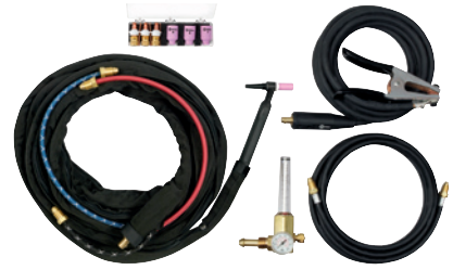
Torch kit 300990 shown.

Air-Cooled TIG Torch Connectors 195379 A-200 (WP-26) 195378* All air-cooled torches (except A-200) 50 mm Dinse-style for one-piece air-cooled torch. *A-80 (WP-24) torches require 24-5 connector.