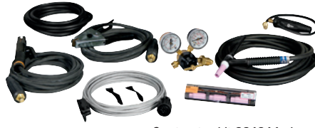
Contractor kit 301311 shown.

Contractor Kits 301309 A-150 with RFCS-14 HD 301311 A-150 with RCCS-14 301549 A-200 with RFCS-14 HD 301550 A-200 with RCCS-14 All-in-one TIG/stick welding kit comes with either a Weldcraft™ A-150 OR A-200 TIG torch, RFCS-14 HD foot control OR RCCS-14 fingertip control, 200-amp stick electrode holder and 300-amp work clamp with 15-foot (4.6 m) cables, flow gauge regulator with 12-foot (3.7 m) gas hose, gas hose coupler, AK2C torch accessory kit and TIG torch connector.