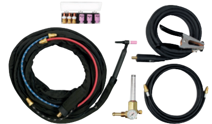
300990 kit shown.